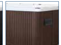
*Espresso (Upcharge may apply)