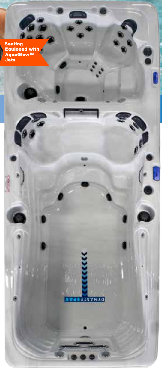
Lucite® Acrylic and Maintenance Free Skirting Options